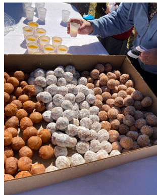
Fun and Fellowship Following the Service